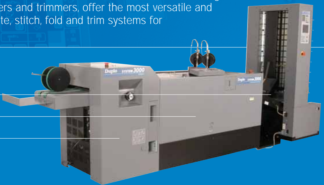
DC-8/32 8 bin tower

Duplo's state of the art vacuum-feed collators, combined with the range of dynamic bookletmakers and trimmers, offer the most versatile and scaleable range of collate, stitch, fold and trim systems for the professional printer.